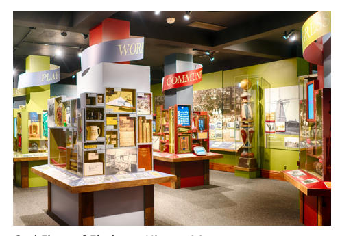
2nd Floor of Elmhurst History Museum

The Elmhurst History Museum's mission is to engage people with history through thoughtful collection, enlightening exhibits, and diverse educational opportunities. To that end, the museum strives to raise the bar in its eclectic offerings of exhibits, programs and special events that engage visitors and provoke thought. Whether it's an original exhibit created by staff, a traveling exhibit from a national institution, a lecture or family program in the Education Center on the beautiful museum grounds—the Elmhurst History Museum always gives patrons something new to ponder and fresh perspectives on history-related topics.