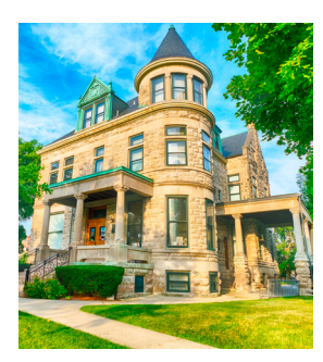
Exterior of Elmhurst History Museum

The museum is located at 120 E. Park Ave in Elmhurst. Hours are Sunday, Tuesday through Friday from 1:00 p.m. - 5:00 p.m. and Saturday from 10:00 a.m. - 5:00 p.m. The museum is closed Monday. Admission is free. For the latest information, sign up for our monthly e-News and follow us on Facebook and Instagram.